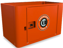
Single Door Lockable Storage