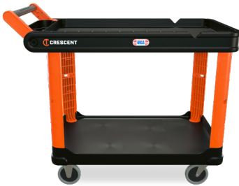
Industrial Utility Cart