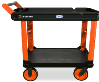
Industrial Utility Cart with 8" Wheels