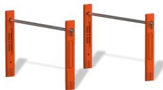
Wire Spool Holders