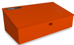
Lockable Angled Workstation