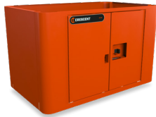
Double Door Lockable Storage