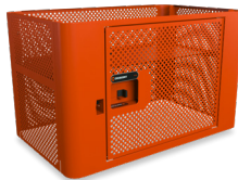
Mesh Single Door Lockable Storage